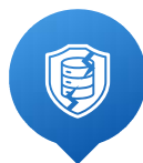
Data breach of personal or confidential data