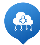
Attacks against cloud platforms